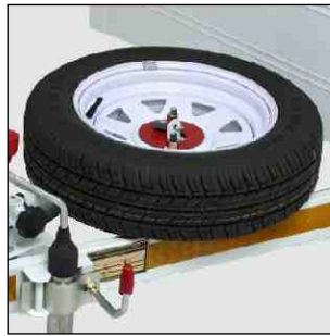
Lockable Spare Wheel