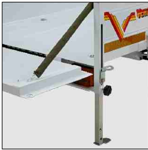
Adjustable support legs