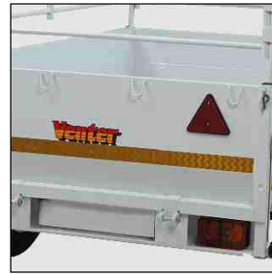
Tailgate, lights and numberplate