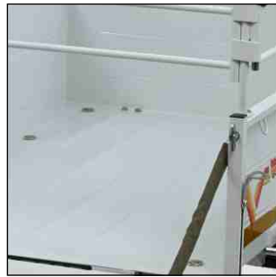
Tie-down rings on side and floor